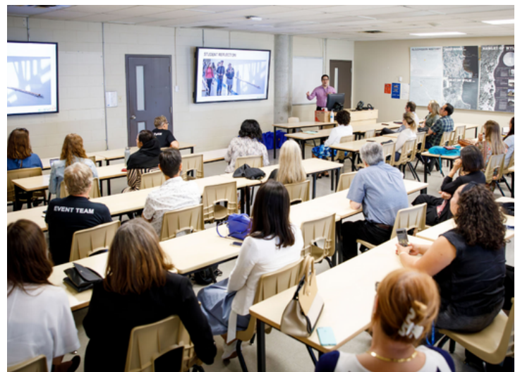
Workshop hosted by GBC employee for GBC employees