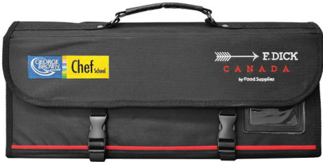
17 PIECE CAPACITY KNIFE ROLL BAG

Below is the entire listing of individual knives and other small wares items that are included in the George Brown College complete baking kit.