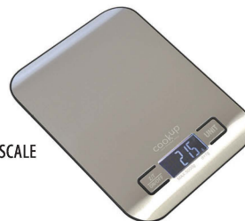
DIGITAL KITCHEN SCALE