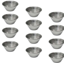
STAINLESS STEEL RAMEKIN/ SAUCE CUP 4OZ 12/PACK