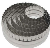
6PC DOUBLE-SIDED CUTTER SET-ROUND