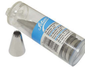
10 STAR DECORATING TIPS