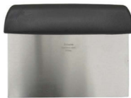
STAINLESS STEEL DOUGH PAN BLOCK SCRAPER