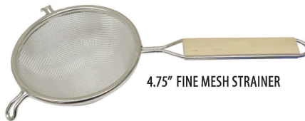
4.75" FINE MESH STRAINER