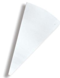
16" PLASTIC COATED THERMOHAUSER PASTRY BAG