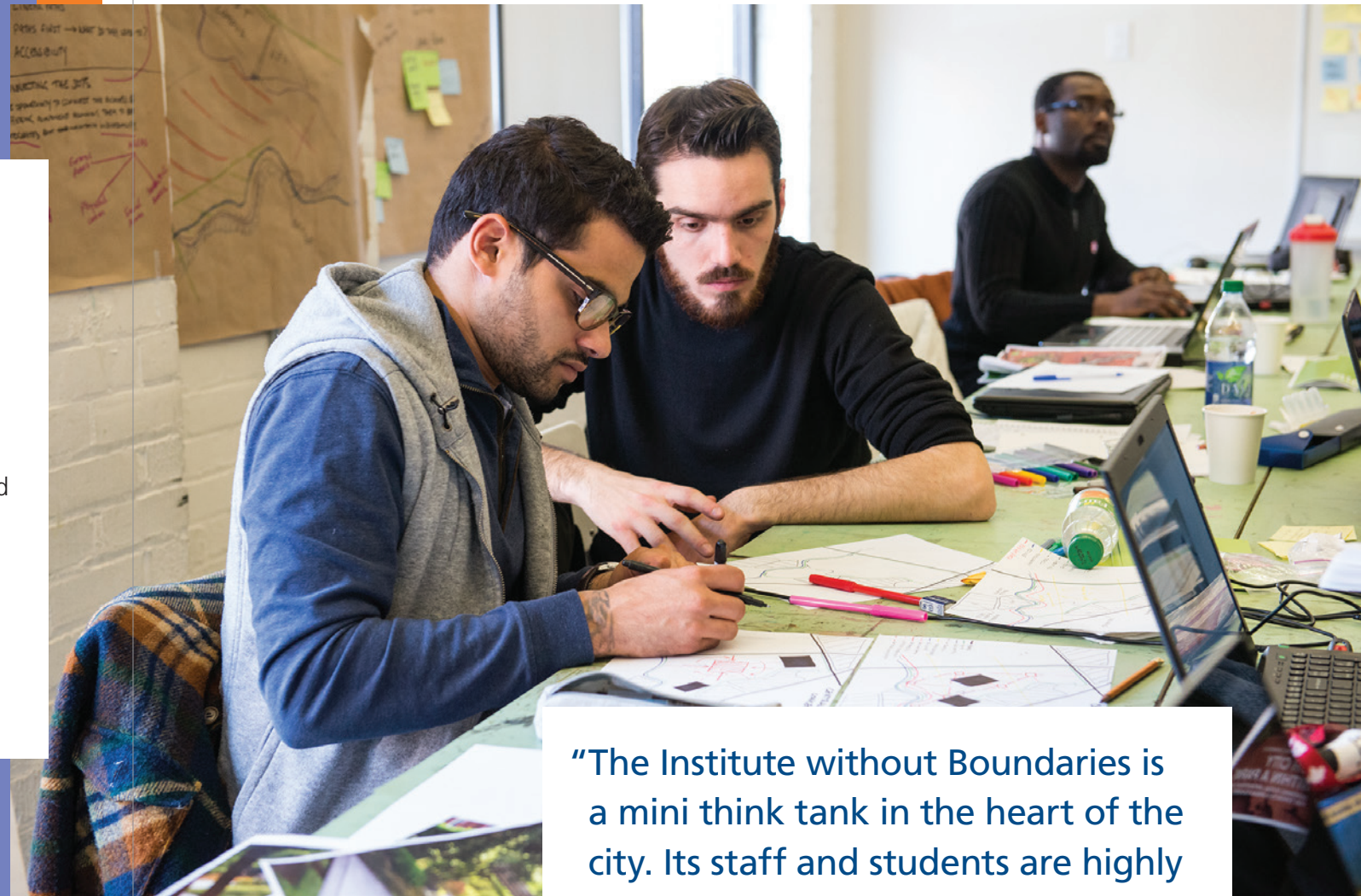
Students design new concepts for Toronto's ravine system at the IwB.

“The Institute without Boundaries is a mini think tank in the heart of the city. Its staff and students are highly professional, insightful and creative, delivering high quality design thinking that enriches Toronto.”